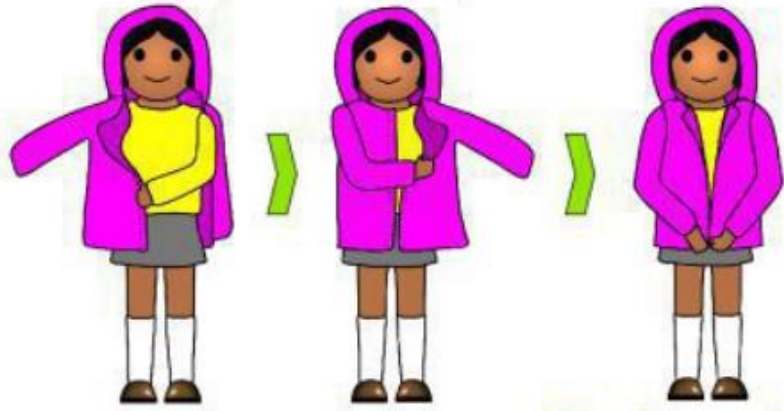
Putting on their own coat