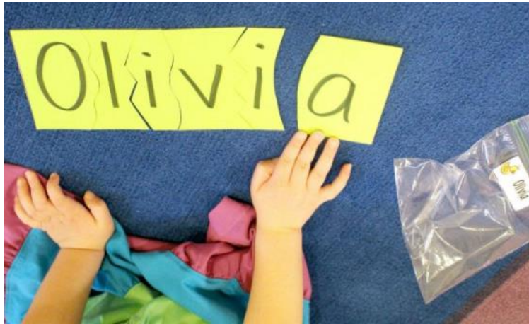
Recognising their own name