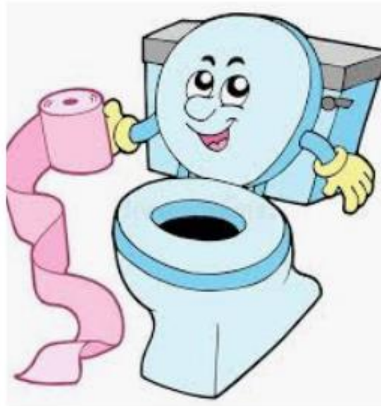
Going to the toilet independently