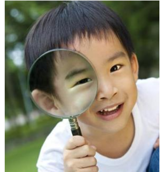
Finding their bookbag etc by themselves