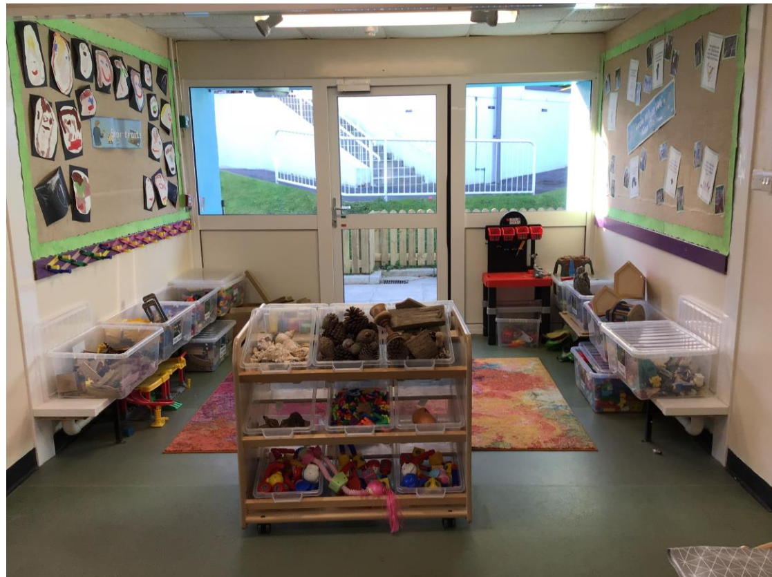
The construction Area